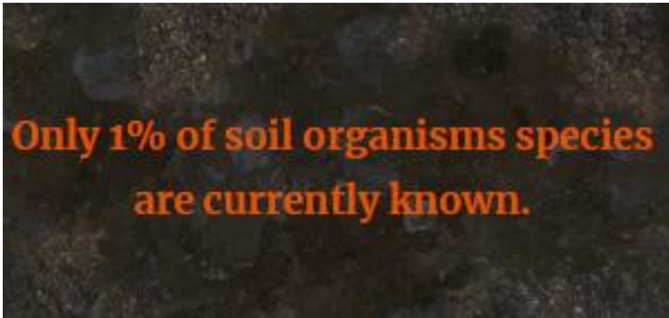
FAO. (2020). State of knowledge of soil biodiversity-Status, challenges and potentialities. Food and Agriculture Organization of the UN. Rome, Italy.