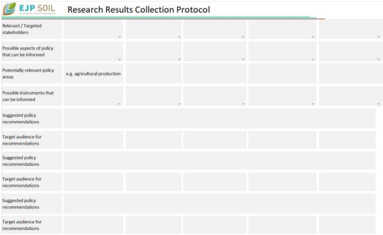
Figure 7 Relevance to policymakers sheet of the protocol for the collection of results