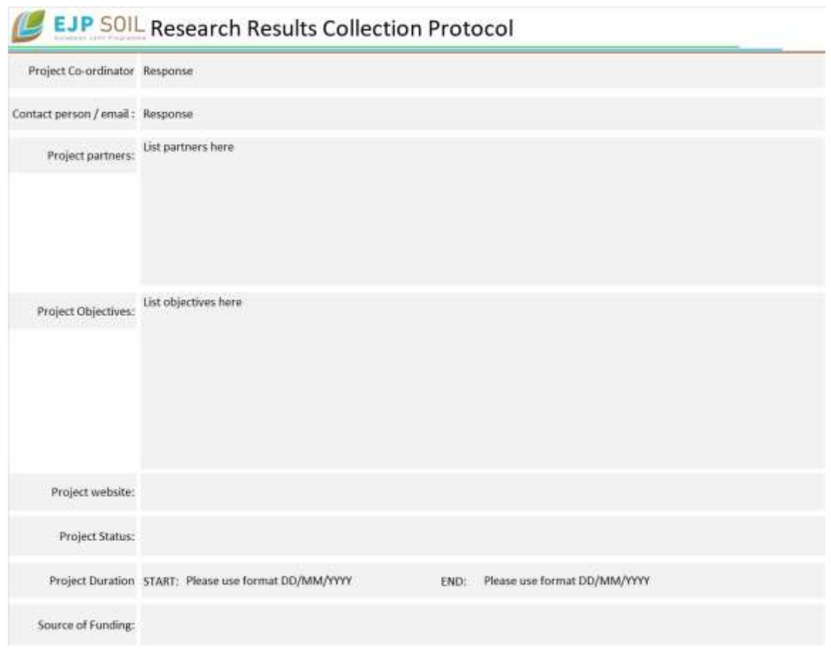
Figure 2 General Information sheet of the protocol for the collection of results