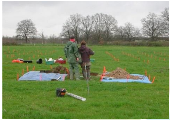
National SMS sampling campaign in France

Several options towards harmonized SMS and LUCAS were discussed and are currently being tested within EJP SOIL WP6 ( Table 1 ). The ambition is to improve the use of the existing data in EU countries and at EU level and also to benefit from the LUCAS campaigns to test harmonization options.